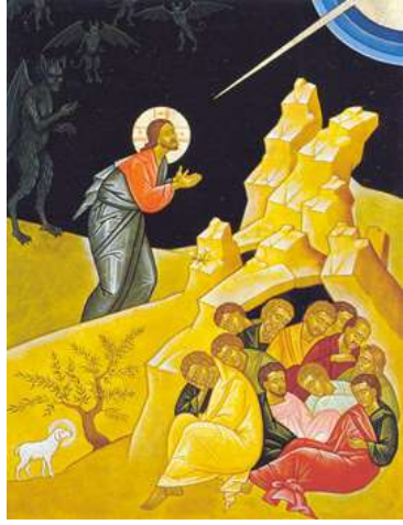
Jesus praying in the garden of Olives