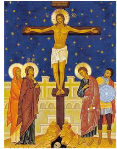
Jesus suffers and dies on the cross