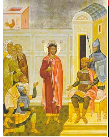
Jesus crowned with thorns