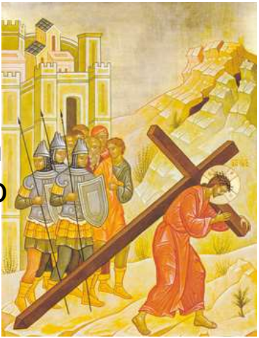
Jesus given the cross to carry to mount Calvary