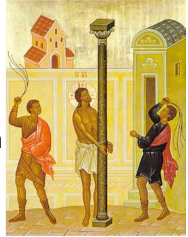
Jesus tied to a pillar and beaten